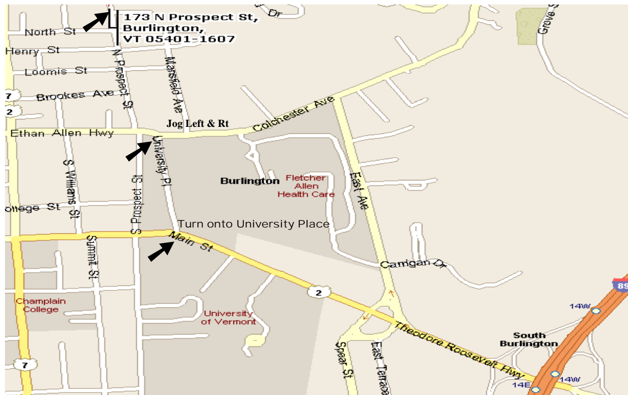
Directions to Quarterly Meeting at Burlington Meetinghouse, Dec. 1 st

From I-89, take exit 14W, US-2 W toward Burlington, continue to follow US-2, Turn right at University Pl., jog left at Colchester Ave. & immediately turn right onto N. Prospect St. Go 4 + blocks to Meeting House on left side of street, at rear of 173 N Prospect St.